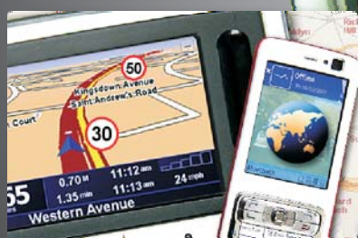
Download traffic data